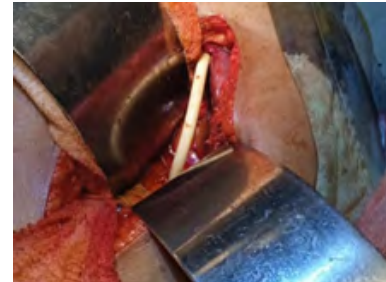
Figure 3: Extraction of the bioprosthesis