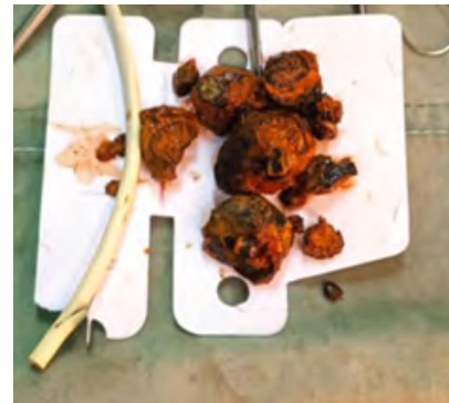
Figure 4: Biliary prosthesis and multiple extracted stones