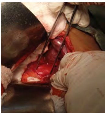
Figure 1: Common bile duct dilation