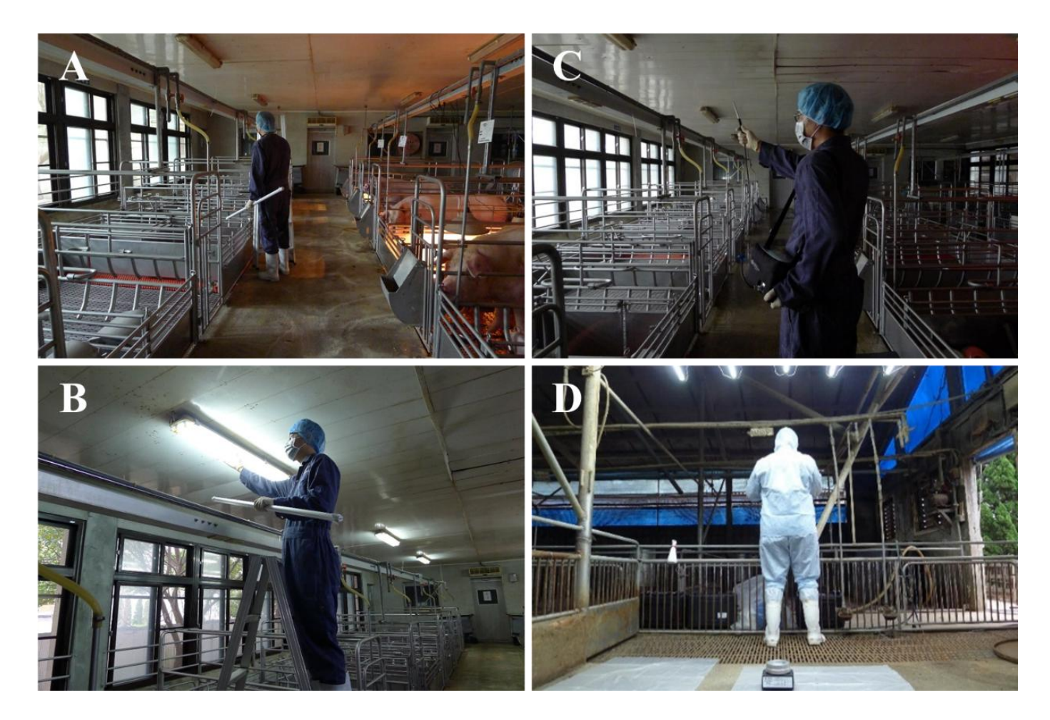
Figure 1: Test of LED device in the SPF pig farm and the traditional pig farm. (A) SPF pig farm. (B) Replace the LED lamp in SPF farm. (C) Erection of LED lamps in the traditional pig farm. White visible LED light was at 450 nm wavelength.