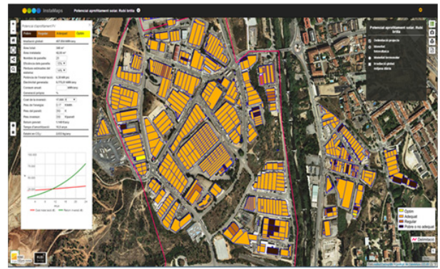
Web tool for consulting the photovoltaic potential of the roofs by ICGC.

To transform Earth Observation data into friendly and useful tools for decision makers is a key challenge at the urban environment. Earth Observation new competences and professionals are paving the way to generate new added value for current and next generations.