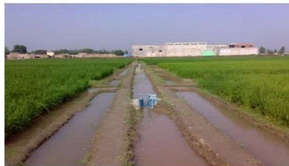
Figure 3: Pictorial Layout of Experimental plots and irrigation channels