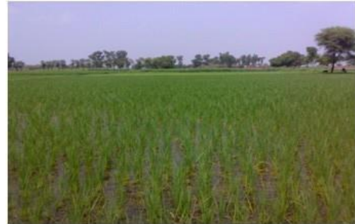
Figure 4: Crop conditions of direct seeded rice at Muridke

Total water application that includes irrigation water and rainfall was recorded as 1479 and 1420 mm under direct seeding and conventional method of rice transplantation respectively. Water productivity of 0.30 and 0.26 kg/m 3 was found under direct seeding and conventional method respectively. Water productivity under direct seeding was 15% higher than conventional rice transplantation method.